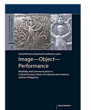
Image - Object - Performance: Mediality and Communication in Cultural Contact Zones of Colonial Latin America and the Philippines (Cultural Encounters and the Discourses of Scholarship)